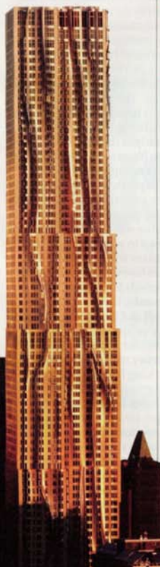
The building's bottom floors will house a school